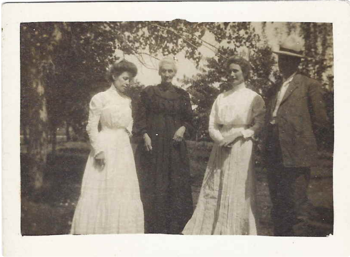
Abt. 1903 (?)