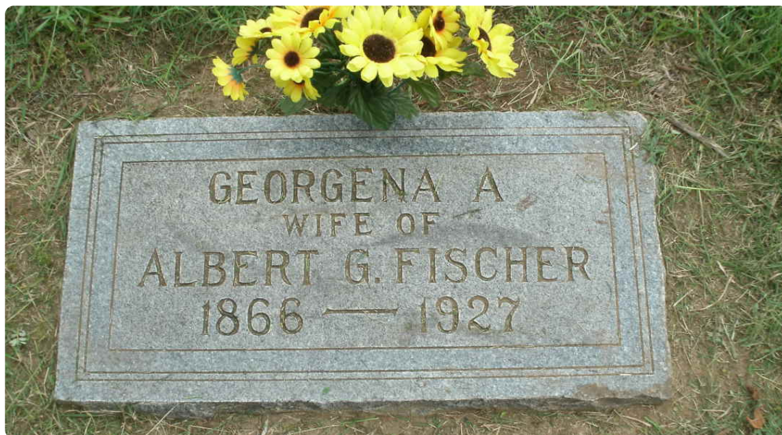
Duncan, Stephens County, Oklahoma, United States of America