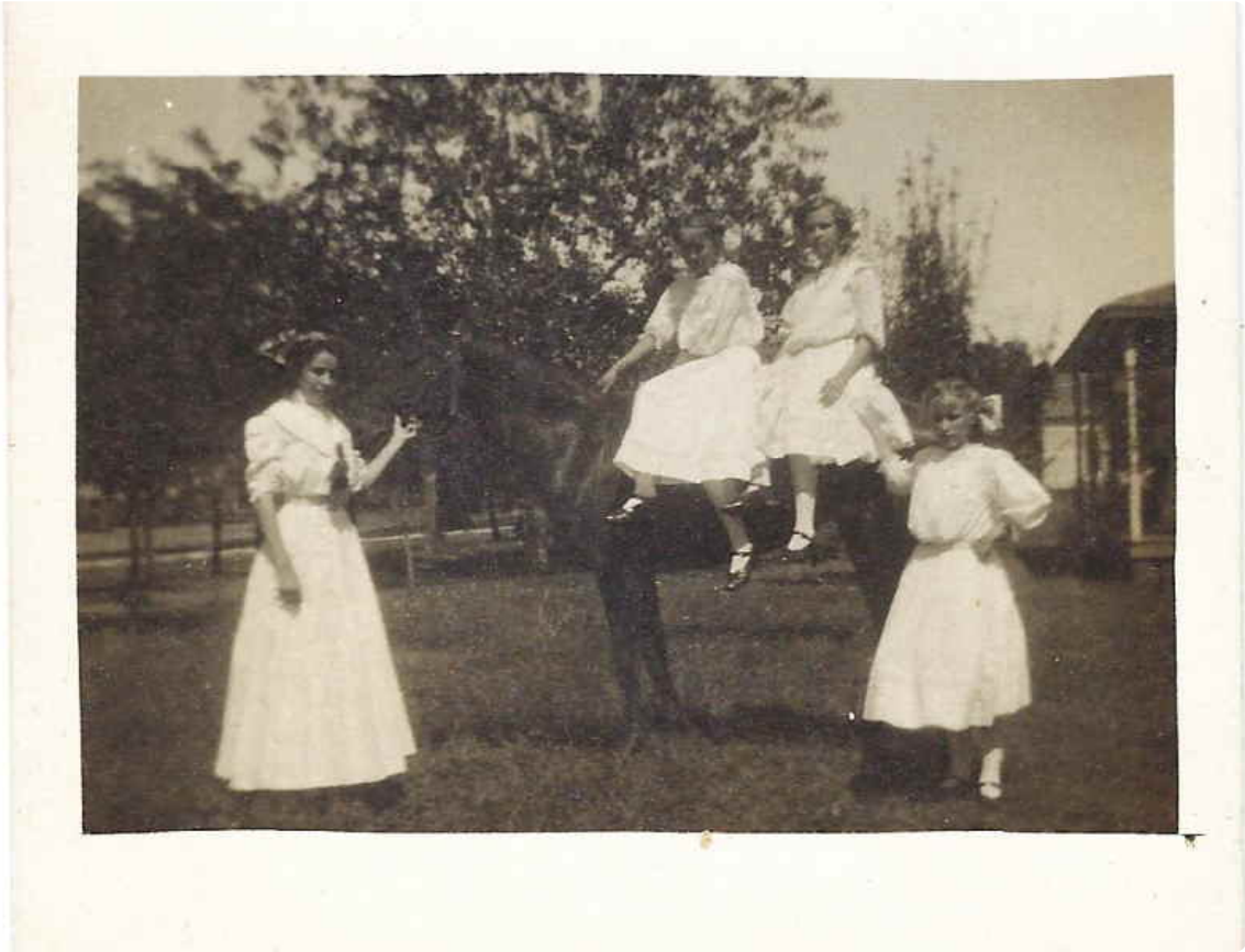
Abt. 1903 (?)