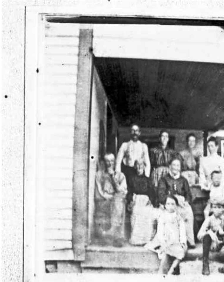
1900 • Littleton West Virginia, USA