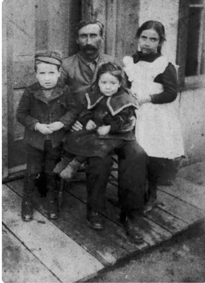
Abt. 1902 • Littleton West Virginia, USA