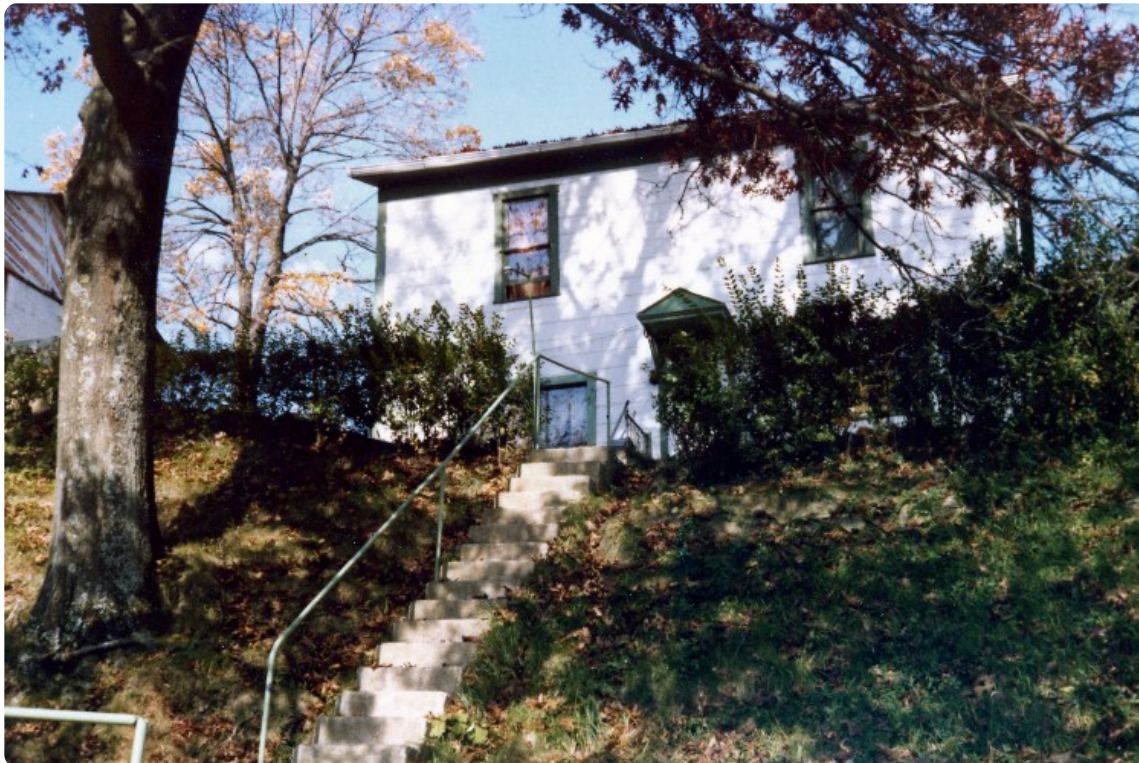
1900 • Littleton, Clay, Wetzel, West Virginia, USA